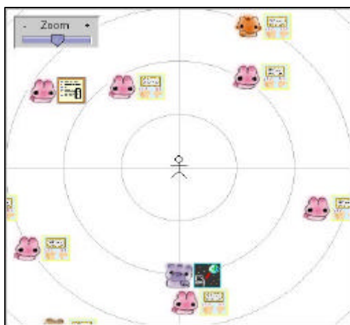
a) Full version